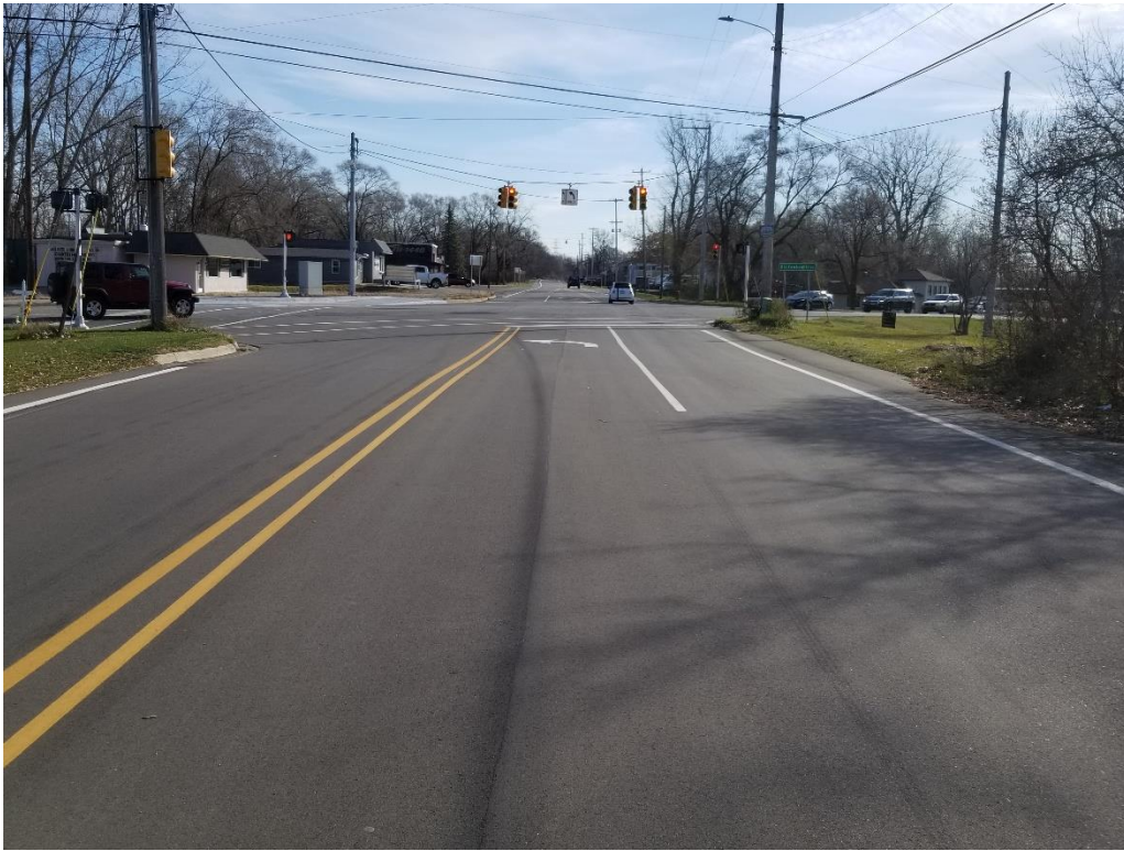
Before Construction (Looking East at Euclid Ave/M-247)