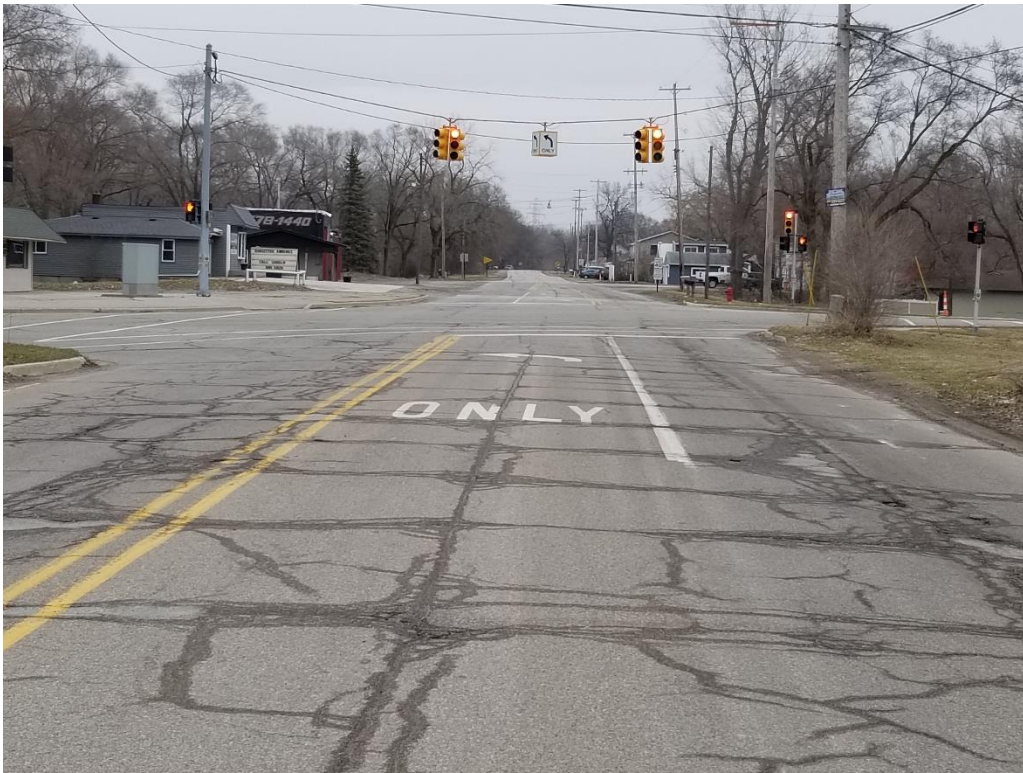
Before Construction (Looking East at Euclid Ave/M-247)