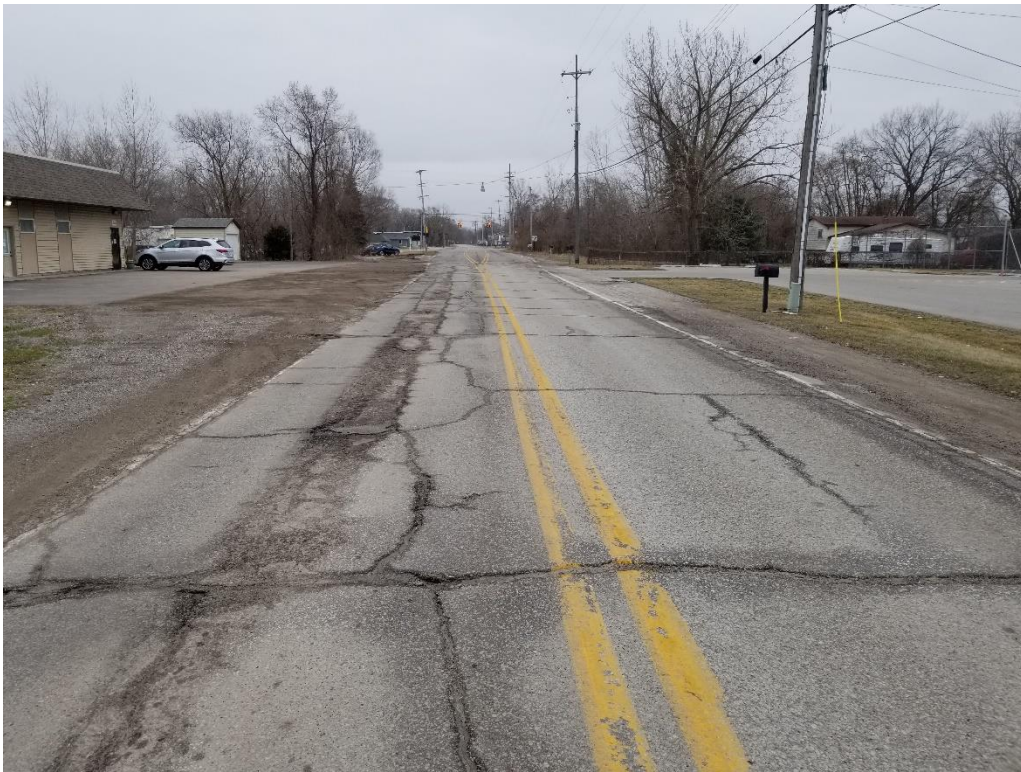
Before Construction (Looking East from Wheeler Rd)