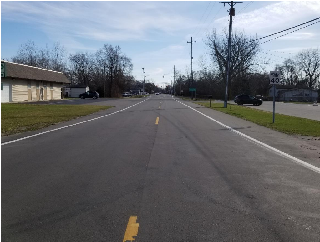
After Construction (Looking East from Wheeler Rd)